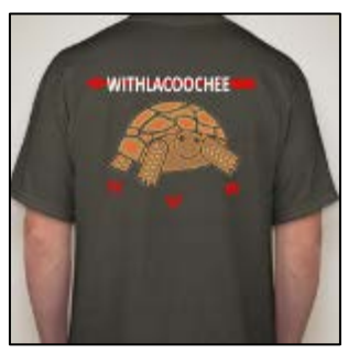
Our popular Withlacoochee Lodge T-Shirts will be available at the Winter Banquet in January 2018. Cost per T-Shirt is $12.00.