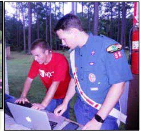
2016 SUMMER FELLOWSHIP