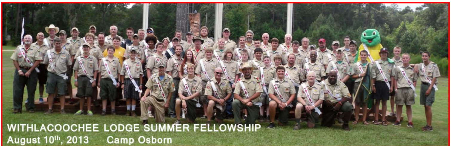
WITHLACOOCHEE LODGE SUMMER FELLOWSHIP August 10 th , 2013 Camp Osborn