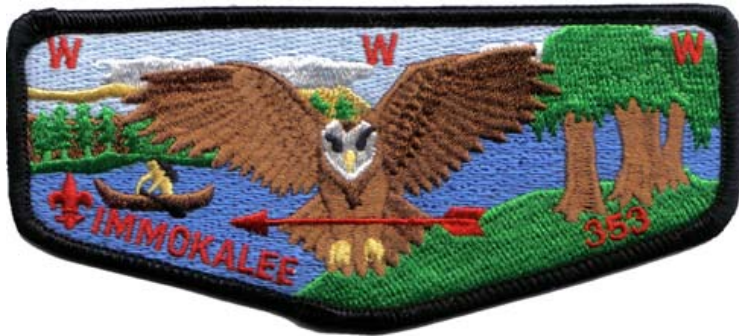
Immokalee Ordeal Member Pocket Flap

Upon completion of your Ordeal, you will be entitled to wear the Immokalee Lodge flap (patch) on the flap of your right shirt pocket.